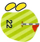
Figure on green represents depth of green.

Driving distance in metres from each tee to red line.